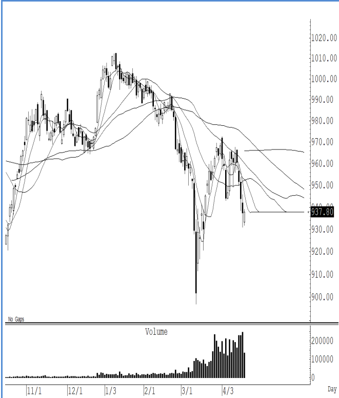
S50M23 (Close 937.80 Chg 0.40)